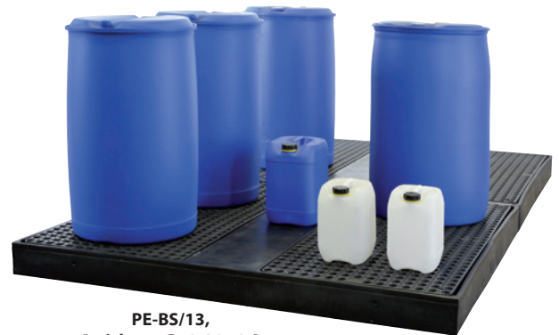
PE-BS/13, Article no. P70-2076-A