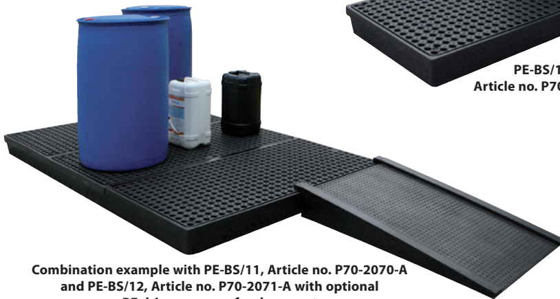
Combination example with PE-BS/11, Article no. P70-2070-A and PE-BS/12, Article no. P70-2071-A with optional PE drive-on ramp for drum cart