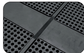
Wannensteg VB 050, Article no. P70-2077-A