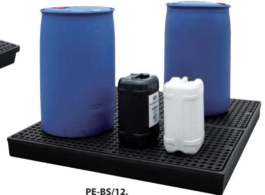
PE-BS/12, Article no. P70-2071-A