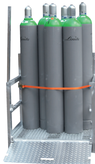
Article no. B69-6413-A