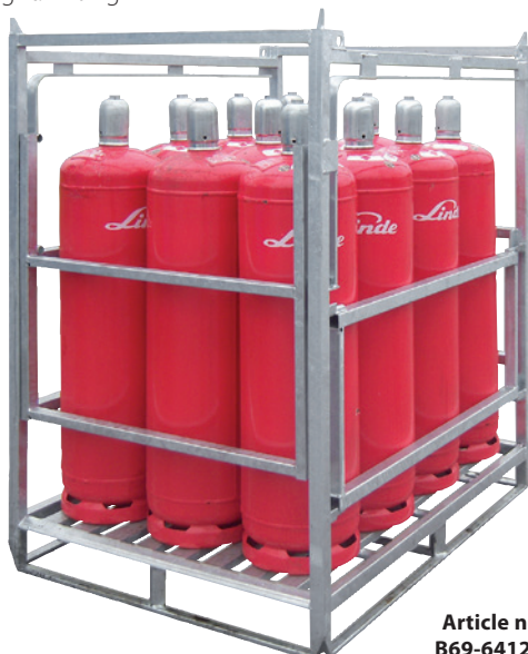
Article no. B69-6412-A