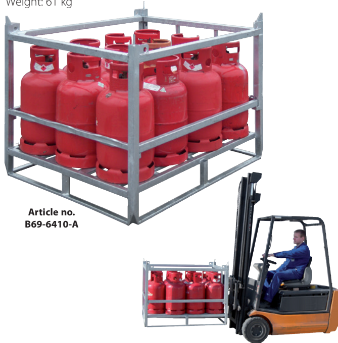
Article no. B69-6410-A