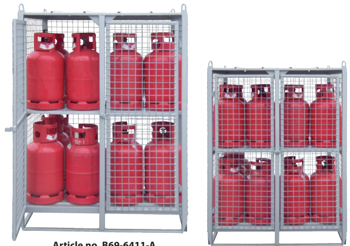
Article no. B69-6411-A