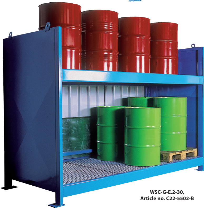
WSC-G-E.2-30, Article no. C22-5502-B