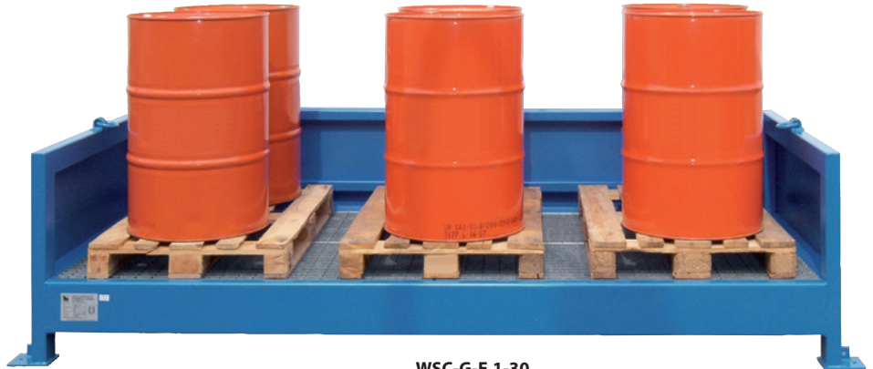
WSC-G-E.1-30, Article no. C22-5501-B