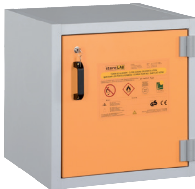
AUS Type 30 / 600 FT, door RAL 1007, Article no. B80-2640-A