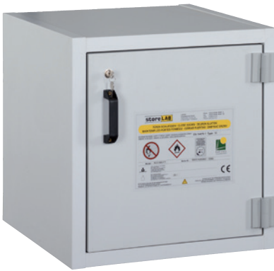
AUS Type 30 / 600 FT, door RAL 7035, Article no. B80-2639-A