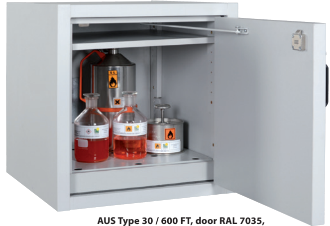
AUS Type 30 / 600 FT, door RAL 7035, Article no. B80-2639-A