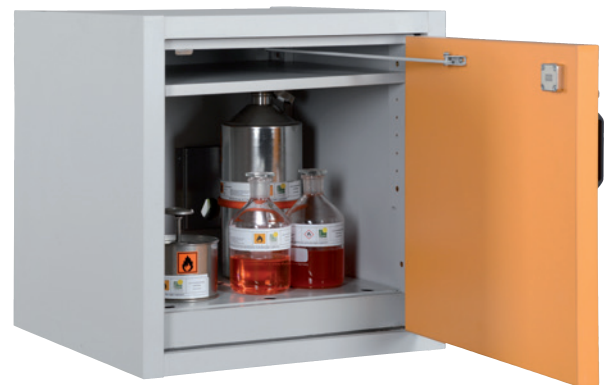
AUS Type 30 / 600 FT, door RAL 1007, Article no. B80-2640-A