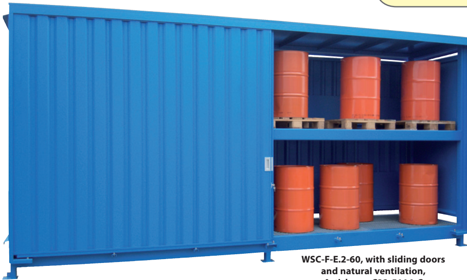
WSC-F-E.2-60, with sliding doors and natural ventilation, Article no. C22-5114-C