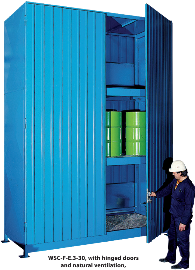
WSC-F-E.3-30, with hinged doors and natural ventilation, Article no. C22-5024-C

Water protection compartment containers are for universal use for the storage of drums directly on the grid supports or on euro-chemical pallets. Water protection compartment containers are particularly suitable for the storage of mixed, non-standardized container sizes.