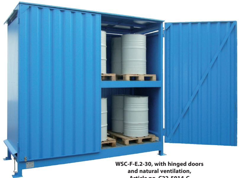
WSC-F-E.2-30, with hinged doors and natural ventilation, Article no. C22-5014-C

All the necessary connections for the assembly, e.g. floor anchors, nuts and bolts, etc. are contained in the standard equipment. Optionally you can have the assembly carried out by one of our teams of specialists. This applies for all water protection compartment containers.